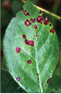
Leaf spots caused by Phomopsis vaccinii .

Management. Prune out infected canes; avoid wounding the canes; plant resistant cultivars; limit overhead irrigation; apply effective fungicides.