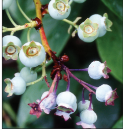
Fruit cluster collapsing due to twig blight.

Fruit infection leads to white mold growth and soft fruit which split when squeezed.